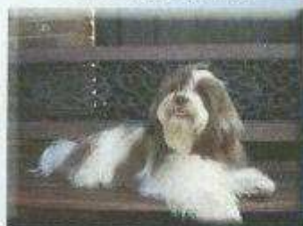
vatter op bank