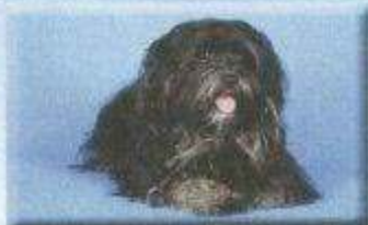
Kuena mis Amores Pequeños