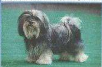
Yohji van het Vogelpark at 14 years