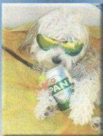
Havie on Holiday