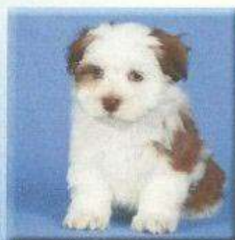
Milow-Millo Tesoro Mio mis Amores Pequenios