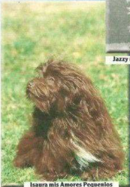
Isaura mis Amores Pequenios