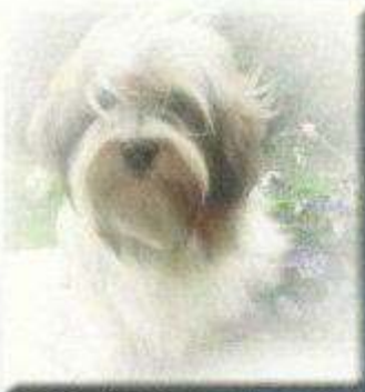
Konchita mis Amores Pequenios