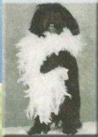
Jazzy mis Amores Pequenios