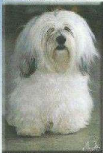
chiabelli mis amores pequenios