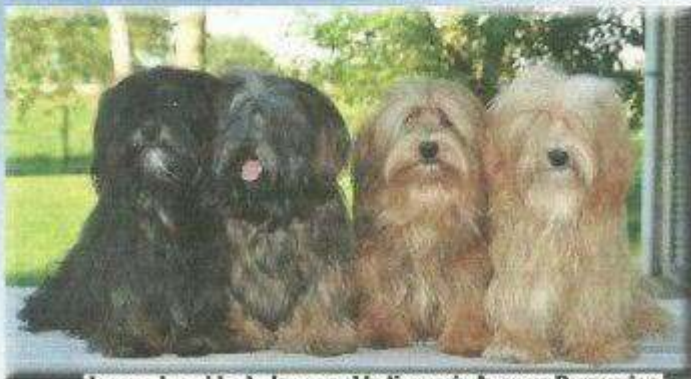
kuena, kuerida, kubana and kalima mis Amores Pequeños