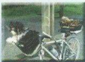
havane and jazz mis Amores Pequeños