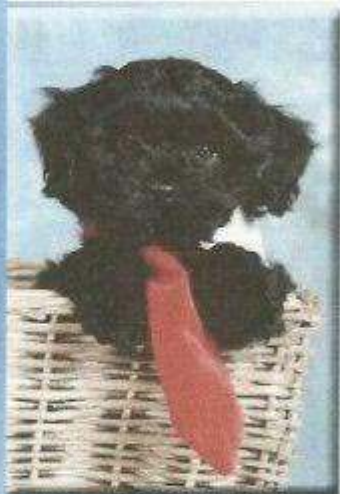
Filou( Jiska)mis Amores Pequeños