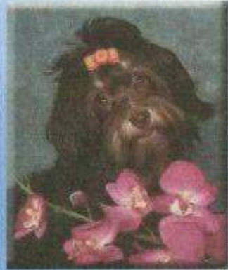
Lilo-Lou mis Amores Pequenios