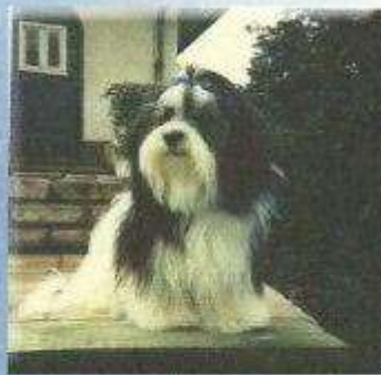
Nougat van het Vogelpark born April 21, 1989, deceased Octo- ber 14, 2006 at 17 1/2 years old