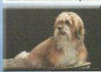
Elmo mis Amores Pequeños