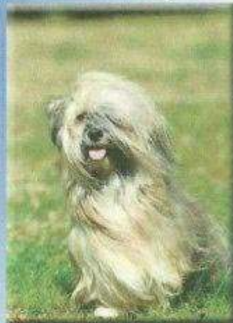
El-Pancho mis Amores Pequeños