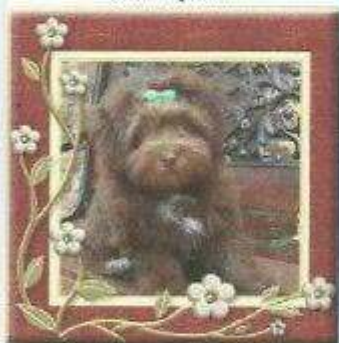
Massivus Angel's Chocolate Virag at 4 months