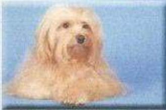
Ilkley Moor Honeysuckle Rose