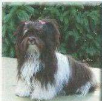
LMiss Pepita - kople